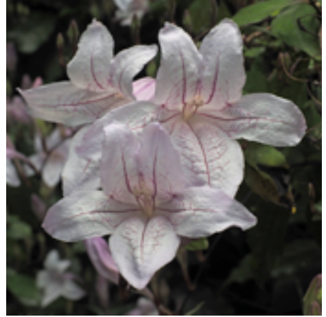
Right: Forest Bells Mackaya bella .

The Giant Spear Lily Doryanthes palmeri is in bloom. It is native to Northern NSW and the Queensland coast. Each giant rosette of leaves flowers once in its lifetime. After flowering, the plant produces new, small rosettes. We are lucky to have several plants growing here so we don't have to wait 8 years before the young rosettes reach maturity and flower again.