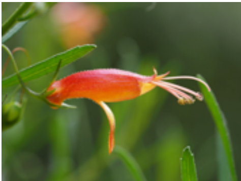
Over page: Map showing plant locations

The Emu bush genus Eremophila , has 271 species. All of them are native only to Australia. These shrubs and small trees grow in arid areas, where they are pollinated by birds and insects. Those with red, orange, yellow or green flowers point slightly downwards and have long projecting stamens and stigma that suit birds. The blue, purple and white ones have protruding lower lips providing a landing area for insects. You will see a variety of these colours and flower shapes in Australian beds (see map over page).