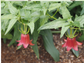
Plant: Canary Island Bell-flower Canarina canariensis

This information was developed by the Volunteer Guides Friends of Geelong Botanic Gardens.