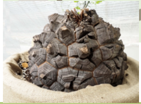
Yam of Elephant's Foot Dioscorea Elephantipes

This information was developed by the Volunteer Guides Friends of Geelong Botanic Gardens. www.friendsgbg.org.au www.geelongaustralia.com.au/gbg/