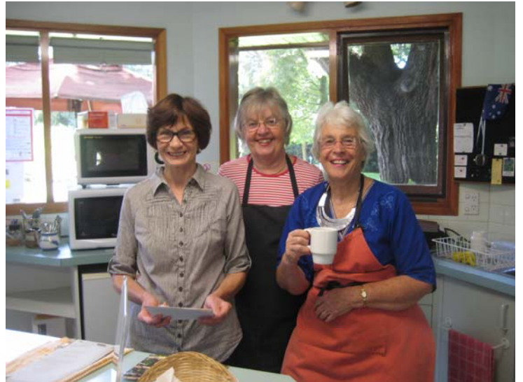
Friends' volunteers working in the teahouse