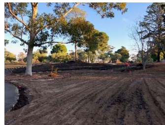
Progression of the Pacific Rim in March 2020