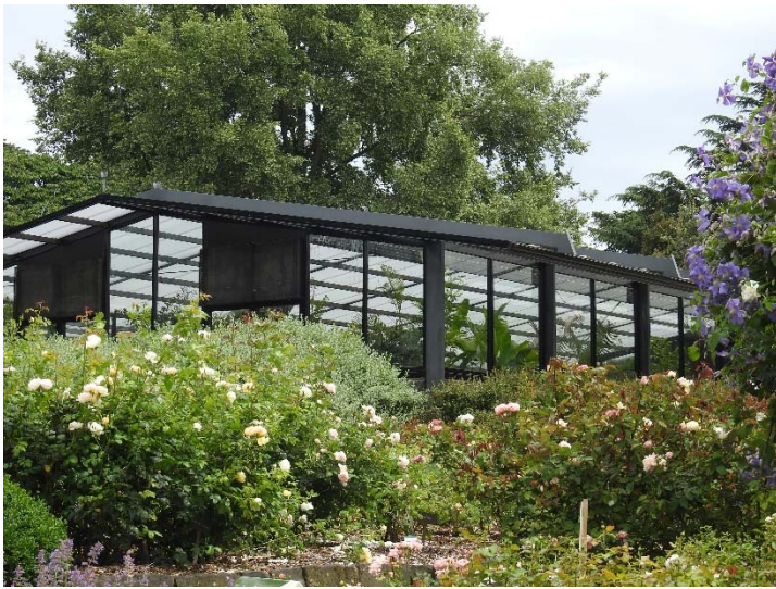
Conservatory reopens after an extensive restoration