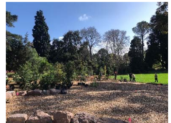
Progression of the Pacific Rim in September 2020

As horticulturally it could be classified under a myriad of categories the main unifying feature of this significant collection is that all of the plants have been sourced from countries bordering the Pacific Ocean. An extensive Living Plant Collection Management Plan has been put together to ensure that the curation of this collection remains true to its purpose.