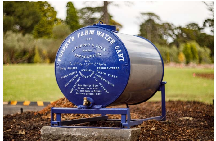
2020, fully restored Furphy Tank

permanent display to the public. The partnership between the Otway Ridge Arboretum and the Geelong Botanic Gardens is a significant expression of true commitment to sustainable land management 3 as well as excellence in horticultural practices. Between 2005 and 2007, the Friends contributed substantially to the acquisition of rare Araucaria and Chilean plants for revegetation of Eastern Park and the Geelong Botanic Gardens.