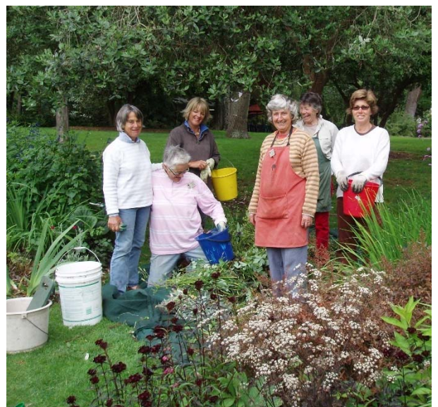
Some of the Perennial Border volunteers