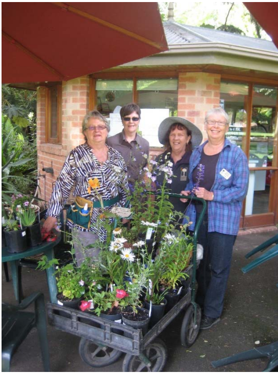
Growers bring plants for sale to the teahouse