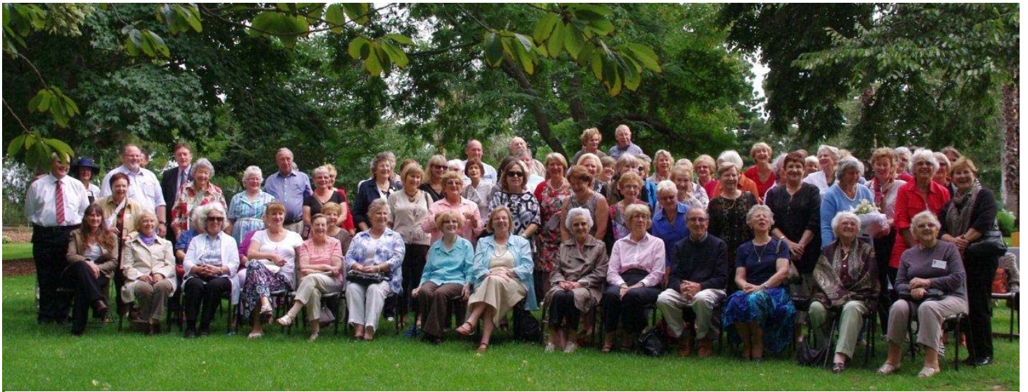
Celebration of The Friends Tea House – 20 years