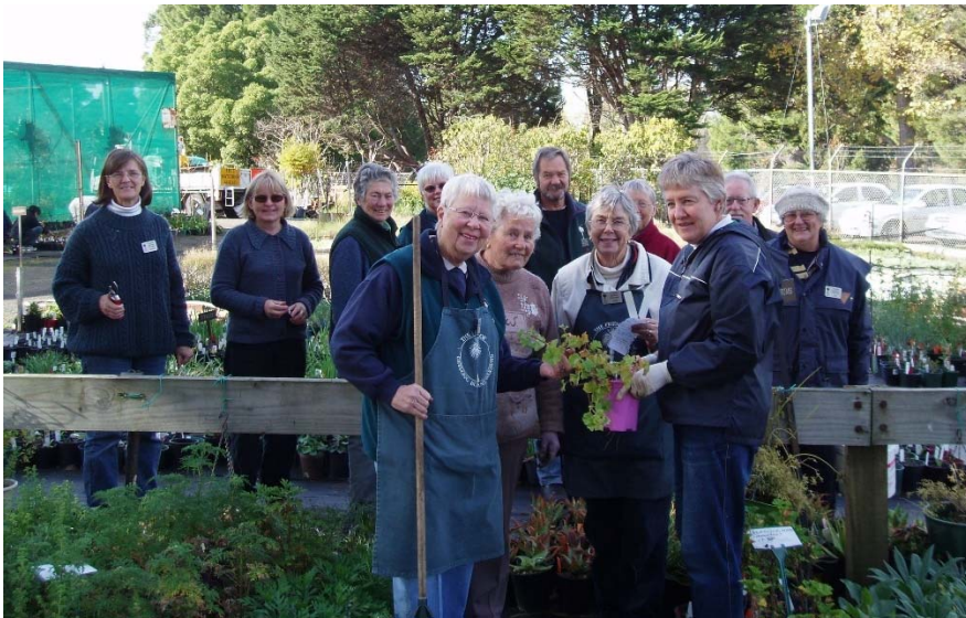
Growers in the Friends' Nursery