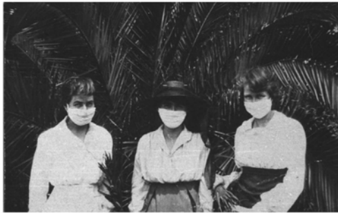
"At Work and Play" in the Royal Botanic Gardens, Sydney, during the 1918 Spanish Flu 1

More than one hundred years have passed since the Spanish Flu. And yet, as evident in this 1918 image from Sydney Botanic Gardens, Botanic Gardens have not only survived, they have flourished. Indeed, so too has our own Geelong Botanic Gardens. This is not our Gardens' first pandemic, and as scientists for decades have been predicting 1 , it is not likely to be the last. What makes a Botanic Garden able to thrive during such adversities while other assets struggle to survive?