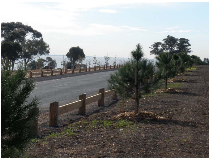
Newly planted avenues thrive in Eastern Park