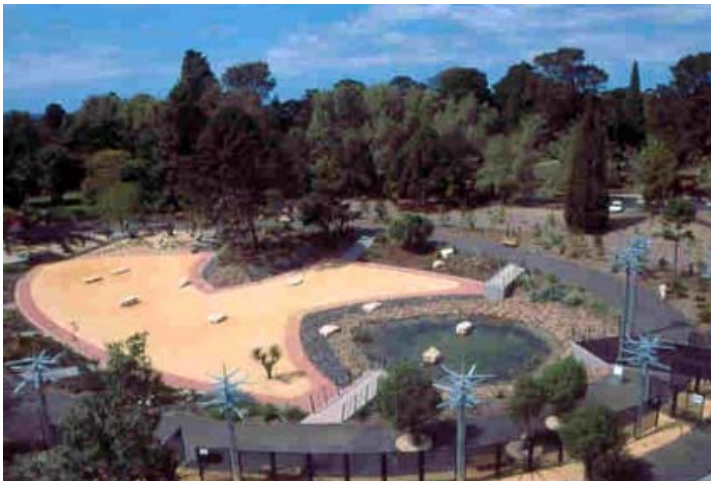
Aerial shot of the new 21 st Century Garden