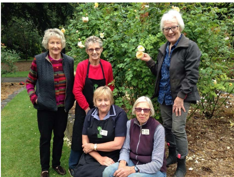
Small group of Heritage Rose Garden volunteers