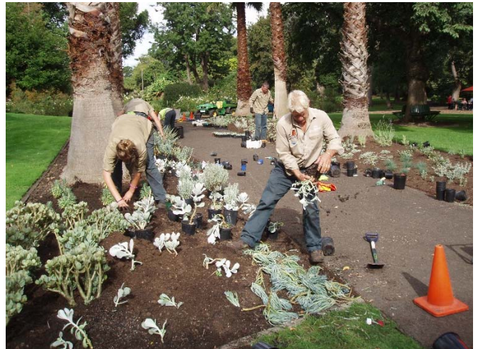
Geelong Botanic Gardens staff planting the Silver Border to celebrate 25 years of The Friends