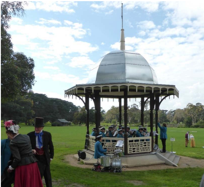
Opening of the restored Ladies' Kiosk in Eastern Park