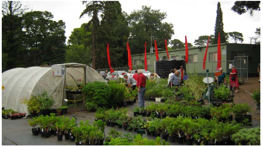
Seasonal Sale at the Friends Nursery several years ago