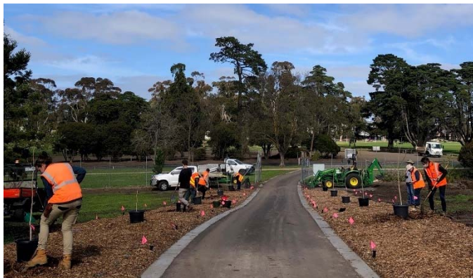
2020 Development of the Pacific Rim Garden

By understanding how humans and urban green spaces interact, we can understand what a Botanic Garden is during a pandemic and how this makes it such an essential asset. Green spaces, such as botanic gardens, are not new concepts but the emerging research now identify them as a direct source of health and wellbeing. This research gives validity to what those of us who are passionate about horticulture have known all along - gardens are good for us. What is most fascinating is that not just any garden will do. The broader a garden's botanic diversity the greater its perceived positive influence on health outcomes within a community 2 . Anecdotally I certainly agree. Within the Geelong Botanic Gardens we have recently seen a larger number of doctors and nurses seeking refuge from increasing workloads due to the pandemic. Families with young children are also visiting in increased numbers, perhaps substituting trees, rocks and grass for locked-down plastic playgrounds.