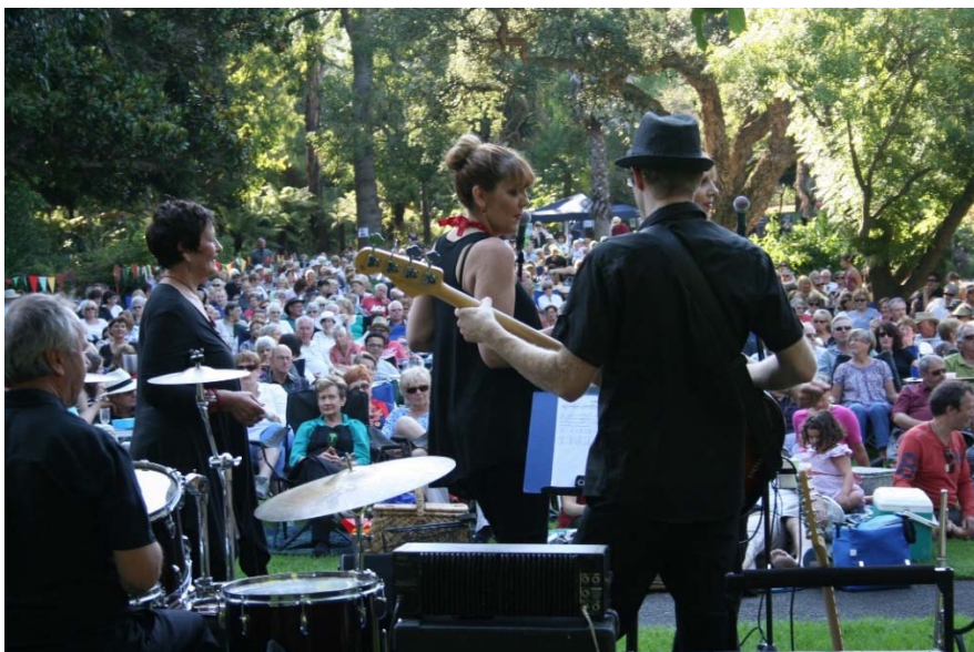
Music in the Gardens – a typical crowd at one of our very popular concerts