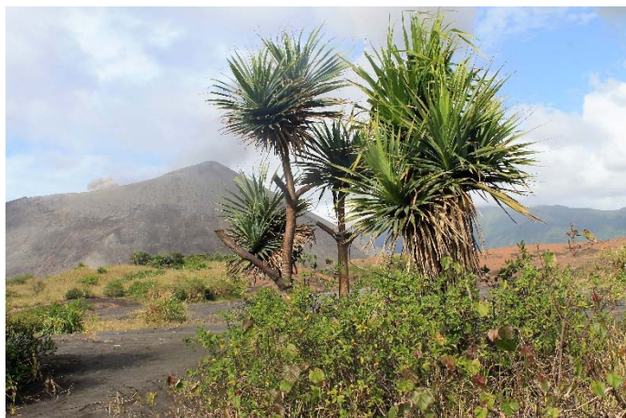
Pandanus on volcanic ash, Vanuatu 2017