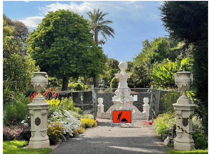
The Hitchcock Fountain restoration begins