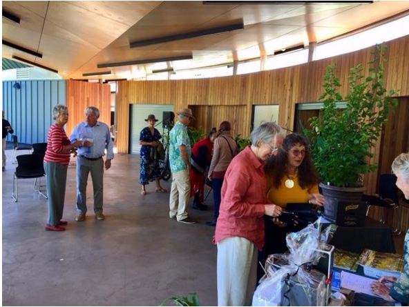
Undercover in the Visitor Facility

With a great deal of excitement, the Friends celebrated a number of “firsts” on the lawn in front of the new Visitor Facility on Friday 11 December 2020. The annual catered Friends Christmas Drinks was replaced with a BYO picnic for members and their partners. This was the first event held at the new community space and it was the perfect place for such a gathering.