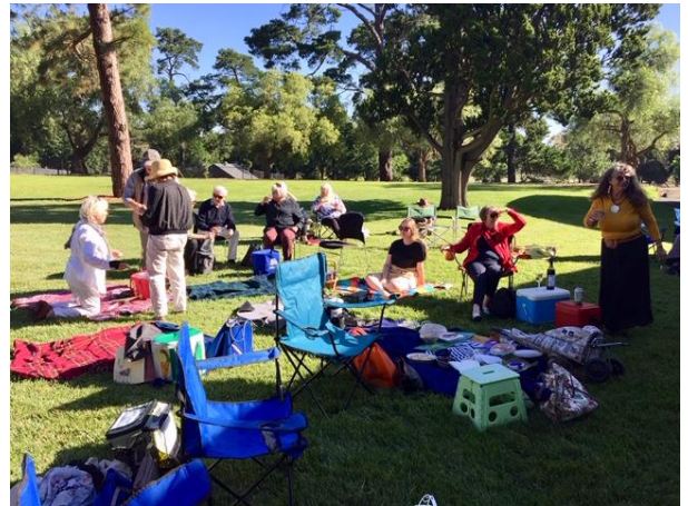
Picnic on the Camellia Lawn