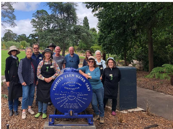
The Friends' Volunteers admire the restored Furphy Tank in the New Pacific Rim Garden