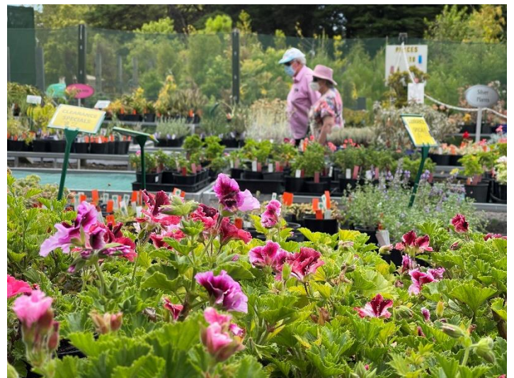
The Friends' Nursery is open again after a long covid closure