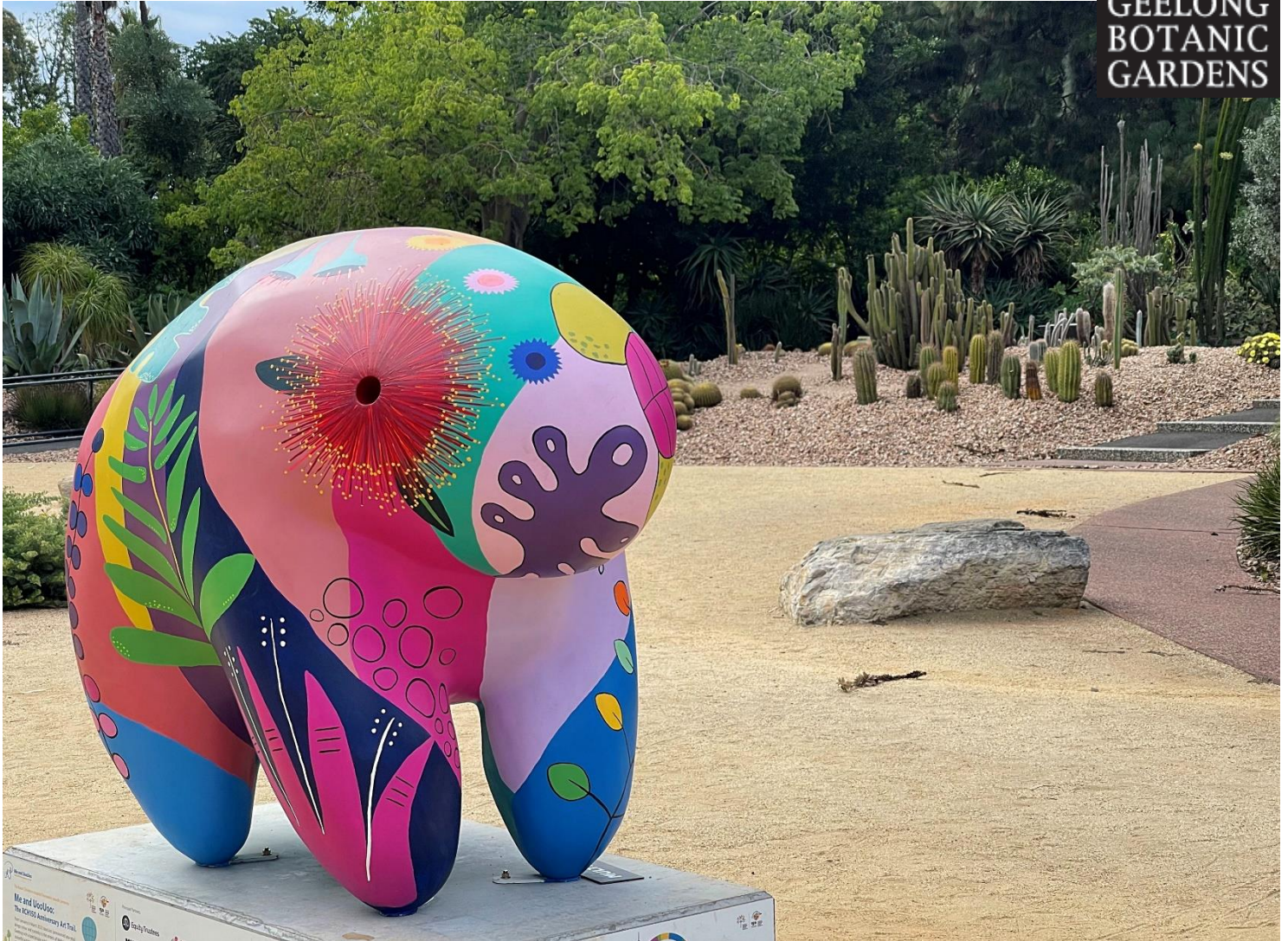
UooUoo Taking Pride of Place in the 21 st Century Garden, helping to raise money for the Royal Children's Hospital