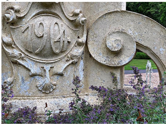
The Hitchcock fountain close up before restoration

In terms of projects already underway, the Hitchcock fountain restoration is coming along well. Each layer of paint and plaster painstakingly removed has revealed the life of the fountain over the decades. The conservator has uncovered many beautiful attributes long lost, including the original brass plaque bearing Hitchcock's name and the year it was donated to the city. Unfortunately, as is often the case with old assets, the damage to the fountain is greater than expected. Yet the conservator has taken all this in her stride and will even be using the same micro silica paint used in 1906. The Friends' commitment to this project could not have come at a better time and has certainly saved this historic fountain, making the restoration project a significant legacy.