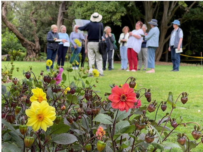
FGBG Guides having a Professional Development session and a good ol' laugh!