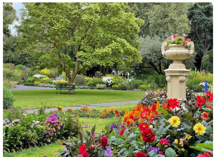
From the Parterre Garden to the Perennial Border