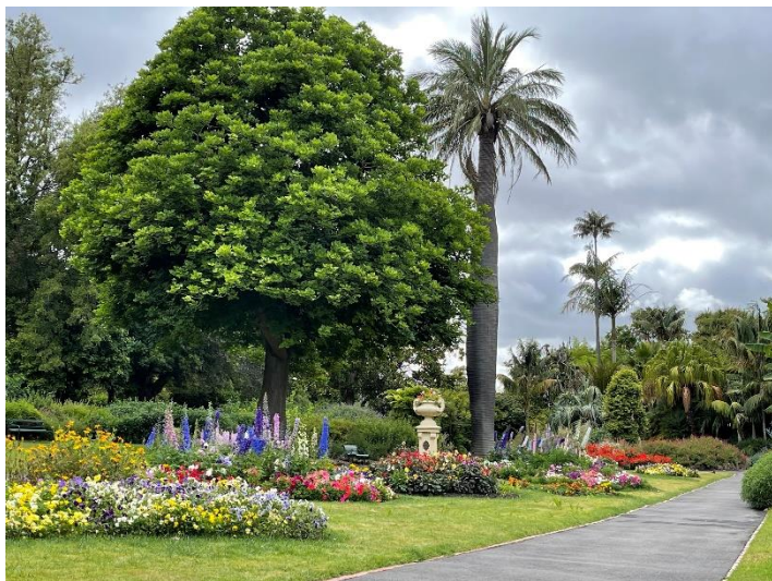
The vibrant Parterre Garden and Jubaea chilensis