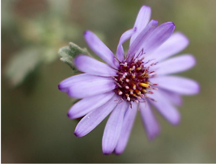
Olearia astroloba RBG Melbourne.

Conservation Status: Threatened – Vulnerable